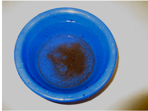
Figure 2 — Sediment layer (including enchytraeids)