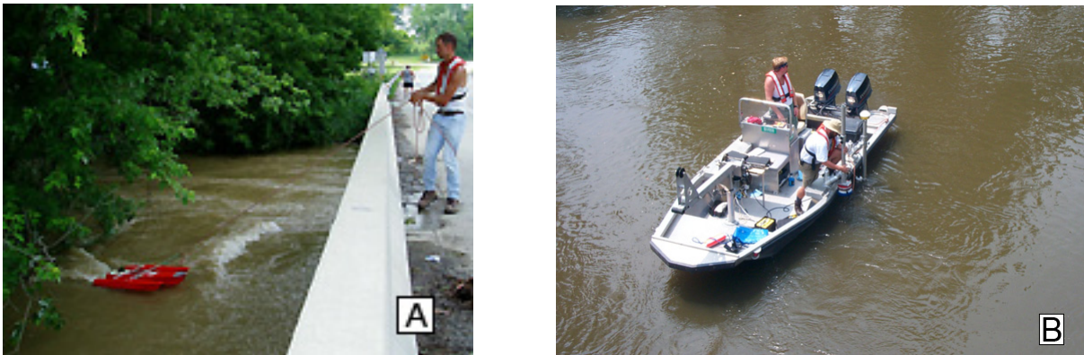
Figure 2 — Photographs showing acoustic Doppler profilers deployed on a small, tethered boat (A) and a power boat (B)

The system software processes and displays a large amount of data so a laptop computer with a minimum of 200 MHz processor and > 64 MB of RAM memory is recommended. The computer screen display should be visible in direct and diffuse sunlight.