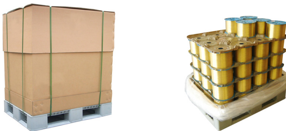
Figure 3 — Example of packaging