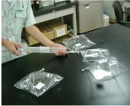
Figure 1 — Injection of master gases