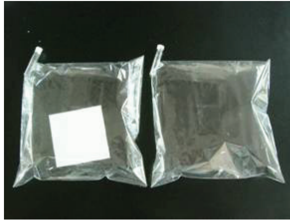
Figure 2 — After injection of quasi unpleasant odour gas in plastic bags with or without specimen