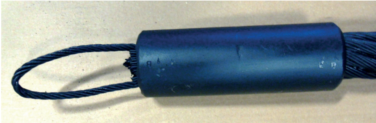
Figure 6 — Example of a semi-rigid pulling eye termination