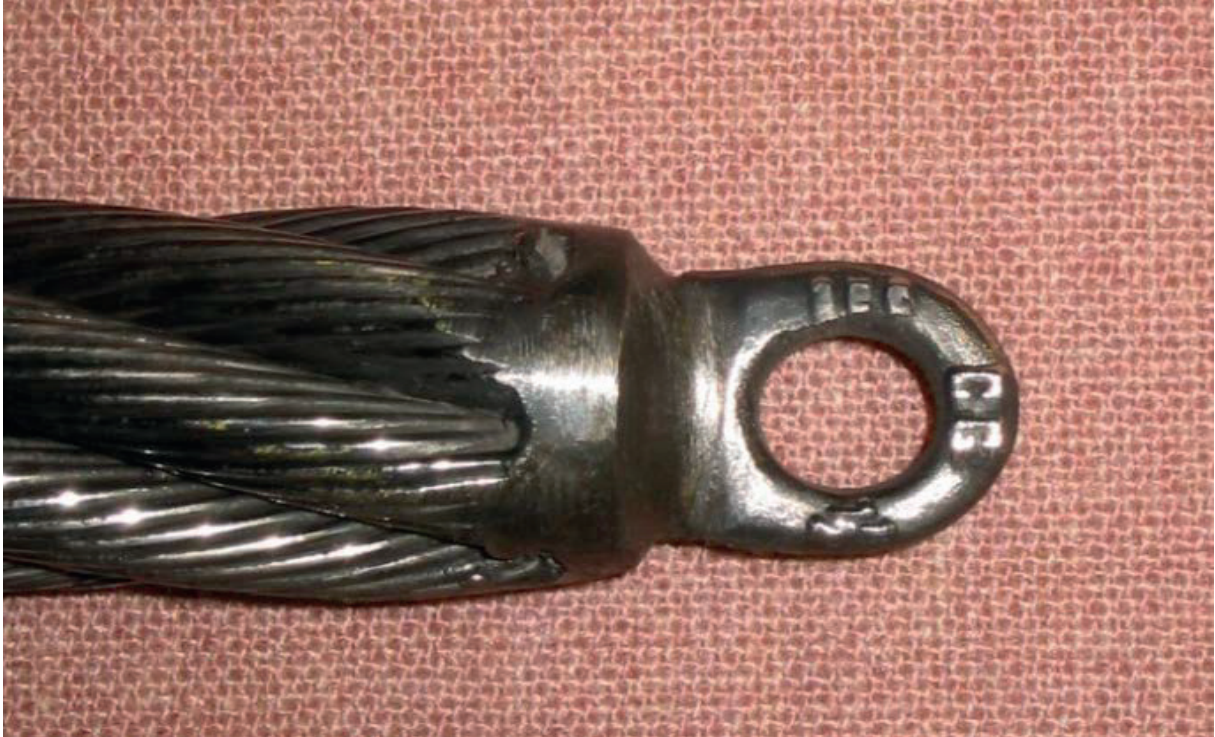
Figure 4 — Typical pad eye or modified eyebolt pulling eye

An illustration of a rigid-type pulling eye incorporating a welded chain link in Figure 5 .