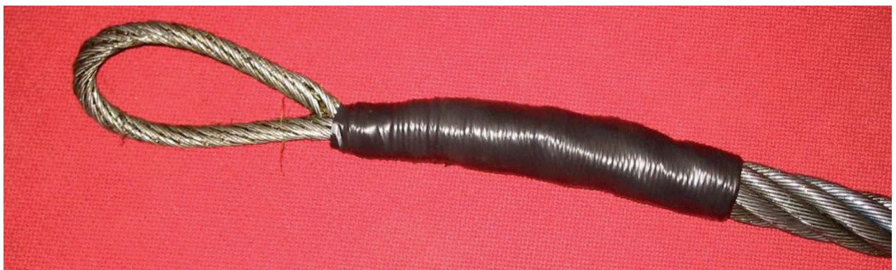
Figure 2 — Completed flexible pulling eye made from the steel core itself

NOTE It is not usually possible for a pulling eye made from the steel core itself to be passed through an aperture of equivalent size to the diameter of the rope.