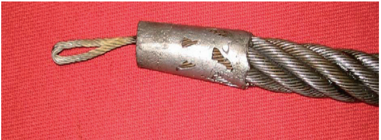
Figure 1 — Completed flexible pulling eye made from the centre strand of the core

An illustration of such a completed pulling eye is given in Figure 1 .