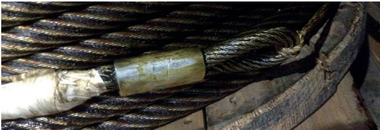
b) Flexible pulling eye made from the steel core and secured with pressed ferrules