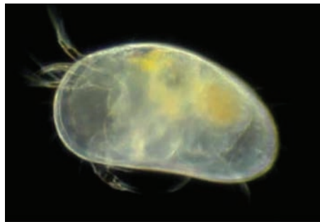
Figure A.1 — Freshly hatched larva (150 µm to 200 µm) of Heterocypris incongruens

When the pools are rehydrated (e.g. by rainfall), and provided the environmental conditions are suitable, the ostracod cysts hatch and the nauplii (150 µm to 250 µm) grow in several moults to the adult stage (about 1 500 µm) and start to reproduce.