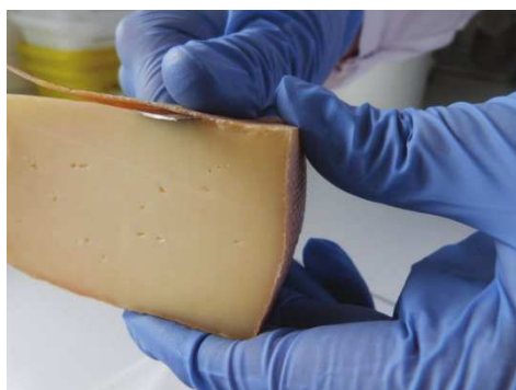
Figure B.3 — Preparation of the test sample of a semi-hard cheese