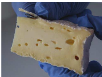
Figure B.2 — Preparation of the test sample of a soft cheese