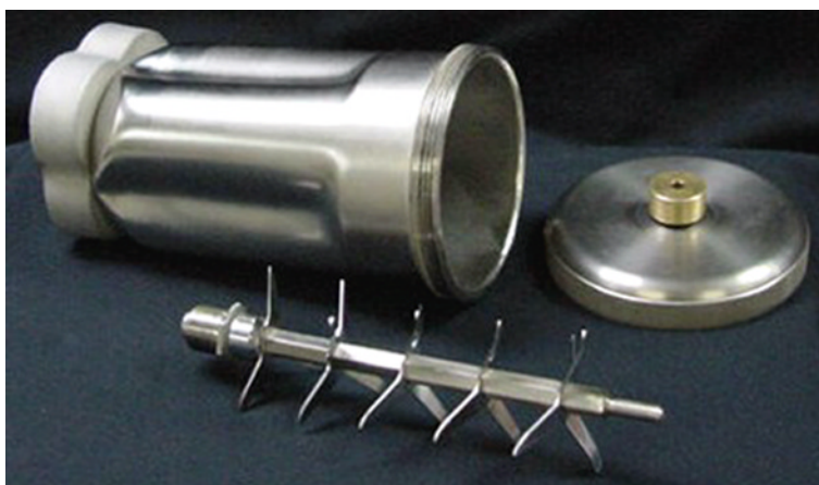
Figure 1 — Blending container and multi-blade assembly

The assembly consists of five standard blades attached to a central shaft, and spaced equally along the shaft.