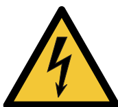
Figure 1 — Marking of voltage class B electric components

The same symbol shall be visible on barriers and enclosures, which, when removed, expose live parts of voltage class B electric circuits. Accessibility and removability of barriers/enclosures should be considered when evaluating the requirement for the symbol.