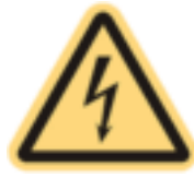
Figure 1 — Marking of RESS

This warning shall be visible when accessing the RESS.