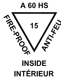
Figure 2 — Example of marking

An example of a clear glass pane of thermally toughened safety glass, with a main glass pane of thickness 15 mm for fire-resistance class “A-60” is given in Figure 2.