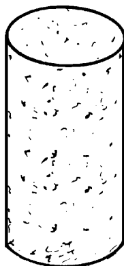
Figure 2 — Agglomerated cork stopper

This type of stopper shall not be used for sparkling wines.