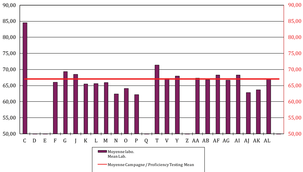
Figure A.4 — Histogram of the distribution of dry mass percentages of viscose

The mean value of test results is 67,03 % for the dry mass percentage of viscose (see Figure A.4 and Table A.2 ).