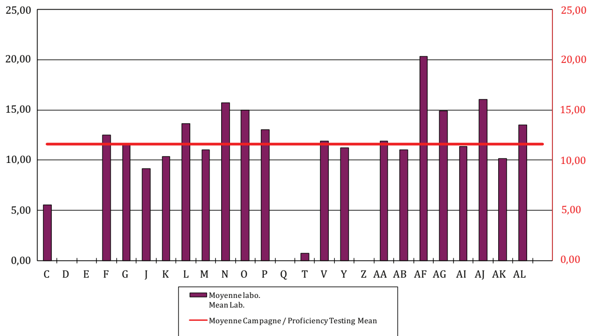
Figure A.2 — Histogram of the distribution of dry mass loss percentages

The mean value of test results is 11,61 % for percentage of loss in dry mass during the pre-treatment (see Figure A.2 ).