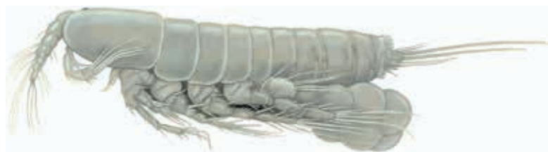
Figure A.1 — Ovigerous Nitocra spinipes female (by Göte Göransson, Sweden)

Observation of this copepod, especially the naupliar stages, is facilitated by using a low-power (6× to 20× magnification) binocular microscope, preferably with dark field illumination. The sex of the animals can be determined visually from about the fifth copepodite stage but owing to small differences in secondary sexual characteristics, the sex is normally not differentiated in the copepodite stages. Identification of the sexual characters requires careful microscopical analysis, which is time-consuming and difficult to perform on live animals. In the adult, the males is distinguished from the females being slightly smaller in size, more streamlined body shape and with a swollen geniculate segment on their first antenna to clasp the female. The females also have ovaries located laterally on each side of the body, which, in the microscope, further distinguishes the two sexes from each other.