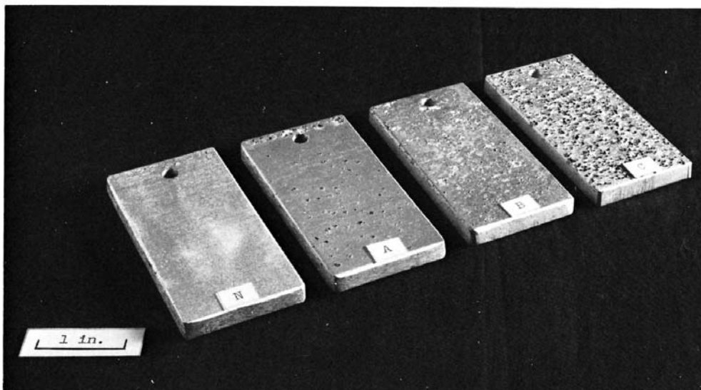
FIG. 1 ASSET Tested Exfoliation Resistant Specimens (N—No appreciable attack; A, B, C—Three Degrees of Pitting and Pit-Blistering)