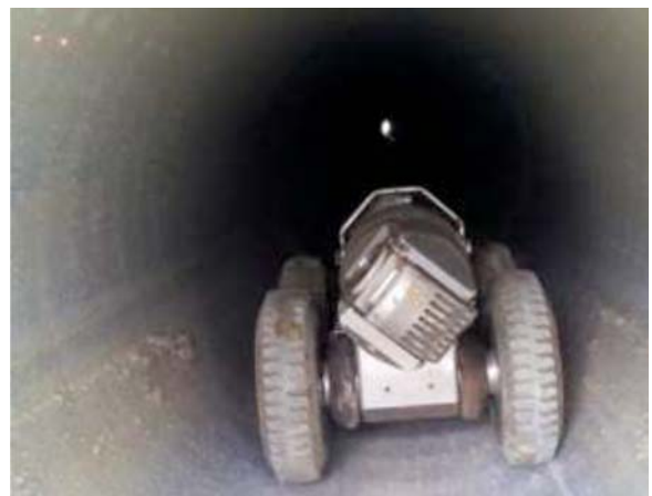
FIG. 1 CCTV—Rotating Laser Profile Camera in Pipe

6.2 Only calibration and laser distance software algorithms, as specified by the software manufacturer, shall be used as per the same specifications of the equipment “Certificate of Accuracy.”