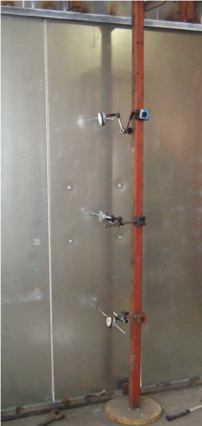
FIG. 1 Setup to Measure Deflection