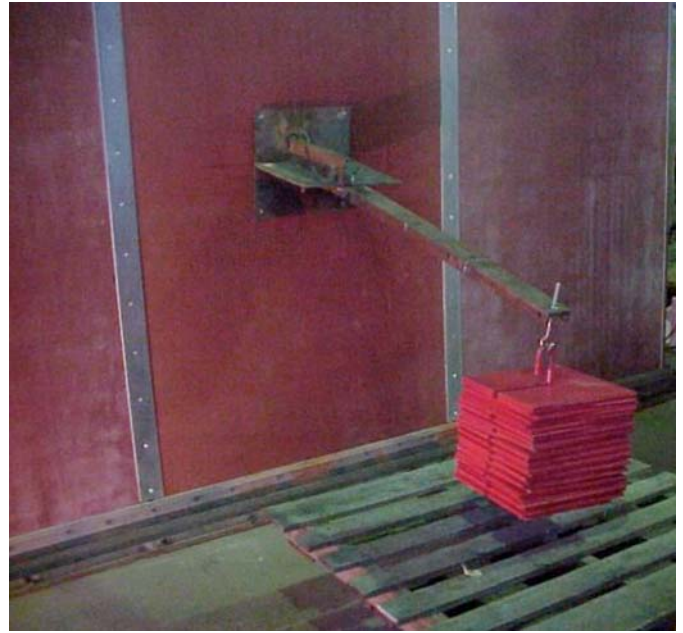
FIG. 2 Loading Bracket with Load Applied at 915 mm [36 in.]

5.4 Load Plates —Weights that attach to the loading bracket. Approximately 20 slotted plates not exceeding 10 kg [22 lb] each for a total recommended load at each interval of 200 kg [441 lb].