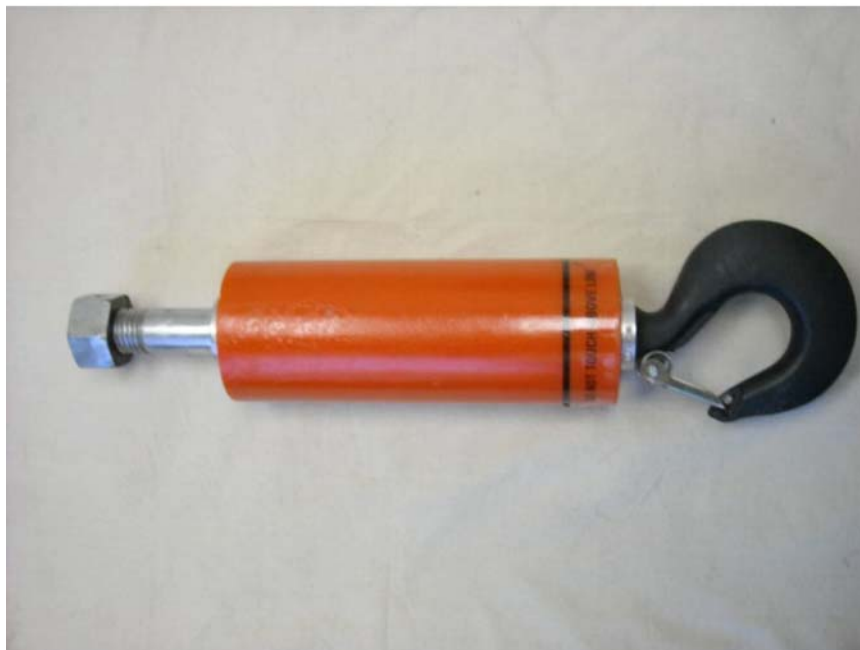
FIG. 3 Views of Some Typical Insulating Links

11.4 Details of any repairs or alterations of the insulating link and a copy of the authorization letter from the manufacturer will be recorded. If the link is sold to another party, these records will be sent with the link.