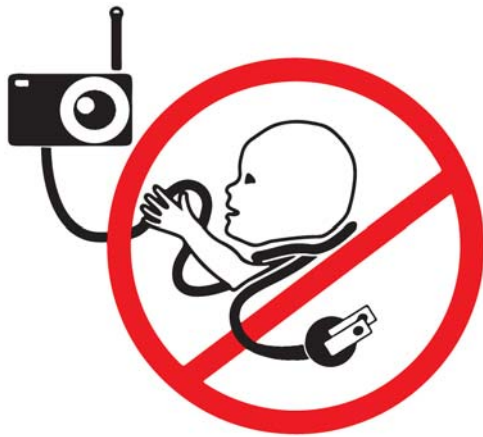
FIG. 2 Pictogram

NOTE 2—Addressed means that verbiage other than what is shown can be used as long as the intent is the same or information that is product specific is presented.