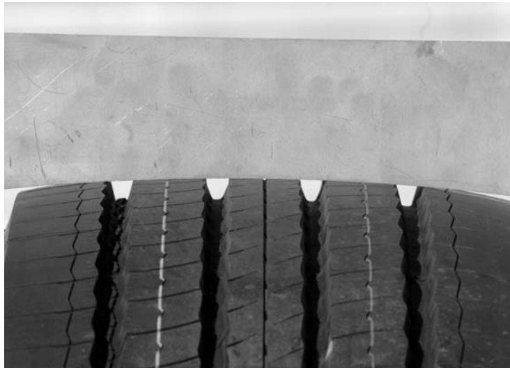
FIG. 4 Measuring a Tread Radius using a Reference Radius Template