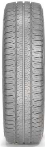
FIG. 1 Front View of the 225/75R16C 116/114S Radial Light Truck Standard Reference Test Tire