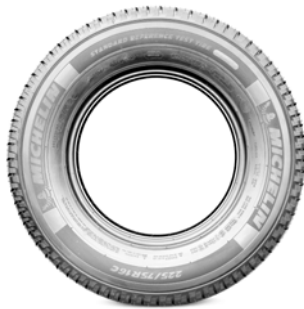
FIG. 2 Side View of the 225/75R16C 116/114S Radial Light Truck Standard Reference Test Tire

and tolerances for cross section and overall diameter found in the current ETRTO Standards Manual. 4