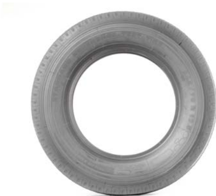
FIG. 2 Side View of the 245/70R19.5 136/134M Radial Truck Standard Reference Test Tire

and tolerances for cross section and overall diameter found in the current ETRTO Standards Manual. 4