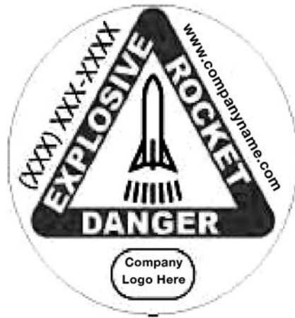
FIG. X1.2 Sample Identifying Label