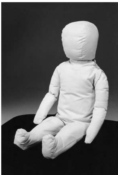
FIG. 1 CAMI Dummy, Mark II

4.1 All testing shall be conducted on a concrete floor that may be covered with 1/8-in. (3-mm) thick vinyl floor covering, unless test instructs differently.