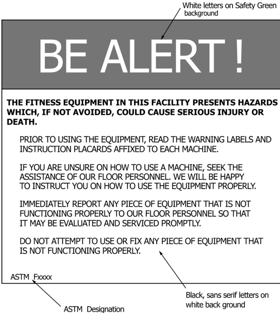
FIG. 3 Example of Facility Sign to be Posted in the Equipment Room(s)

(3) The necessity of seeking assistance or training as to equipment usage.