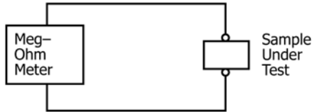
FIG. 2 Test Setup Option