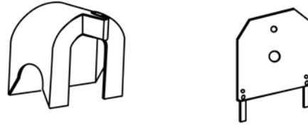
TOP ROLLER GUARD BOTTOM PROTECTIVE PLATE FIG. 2 Top Roller Guard and Bottom Protective Plate

edge of the gate frame. The maximum opening between the gate frame and the guard shall be 0.25 in. (6.4 mm).