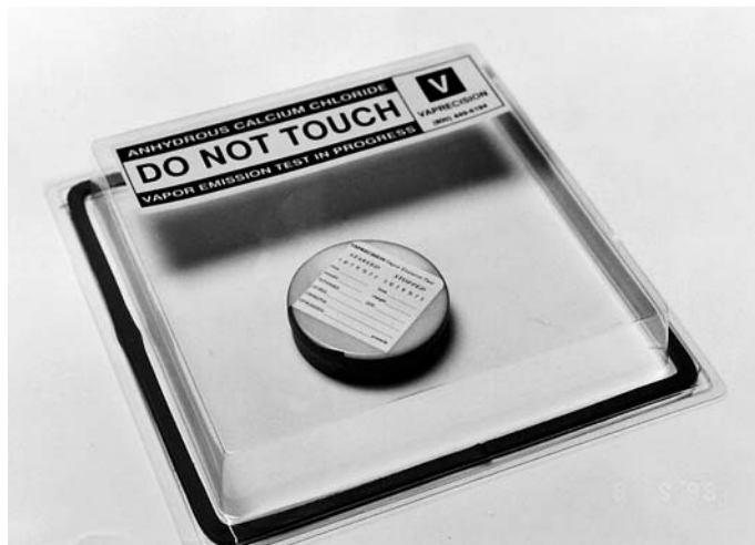
FIG. 2 Anhydrous Calcium Chloride Test

8.2 Specifically indicate any unacceptable conditions observed or determined and source of criteria used.