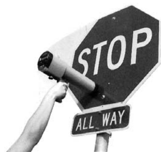
FIG. 3 Portable Retroreflectometer Positioned for Photometry of Sign Face

8.1.5 Repeat the steps given in 8.1.4 for the legend, if it is retroreflective, using the appropriate instrument standard for standardization.