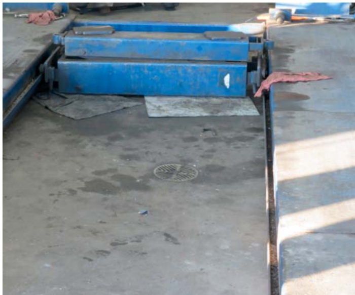
FIG. X1.5 Example of Floor Drain, Example 1

NOTE 1—Floor drains come in various shapes and sizes. Floor drains may lead to the sanitary sewer, the storm sewer, an oil-water separator, an on-site drain field/septic system, surface waters, or discharge directly into the ground below the drain. It is important to know the point of discharge of any floor drain in order to determine if the liquids reaching the floor drain are being properly disposed.