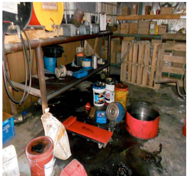
FIG. X1.10 Staining on the concrete floor from improper storage and dispensing of petroleum products. Heavy staining like this may indicate repeated leaks or spills that could migrate through the concrete to the underlying soils.