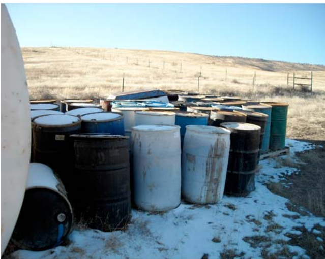
FIG. X1.2 Outdoor chemical storage in 55-gal (208-L) plastic and steel drums.