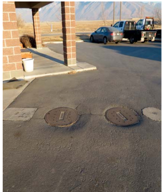
FIG. X1.4 Manhole covers outside a vehicle repair shop leading to a two-stage oil-water separator. Oil-water separators are often located under manholes inside or outside repair garages, oil change facilities, restaurants or at any location where it is necessary to separate oil from water prior to discharge of the water to the sanitary sewer system, an on-site septic system, or to surface waters.