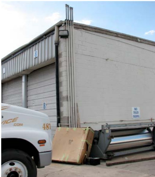
FIG. X1.8 Four vent pipes attached to the exterior wall of a commercial building indicating the presence or former presence of four underground storage tanks nearby.