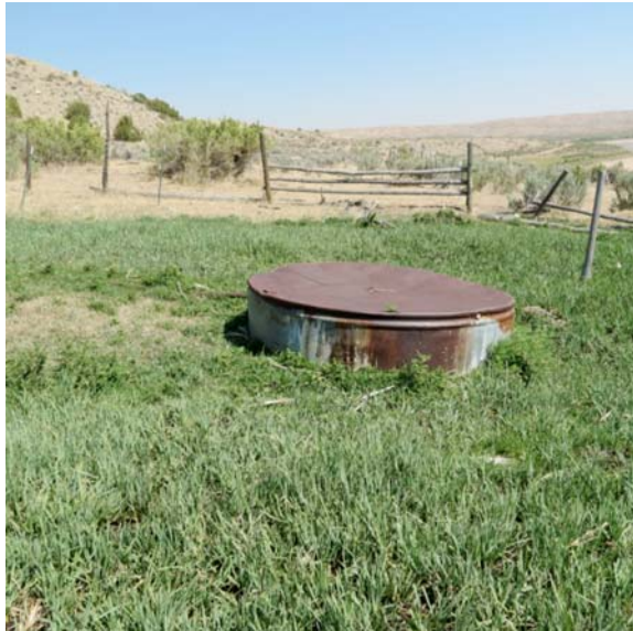
FIG. X1.11 Water Supply Well, Example 1

NOTE 1—Photograph shows a manhole-sized access leading to the well casing located in a field near a farm outbuilding. Releases of chemicals or petroleum products near or into a well can result in the contamination of the groundwater aquifer in which the well is constructed.