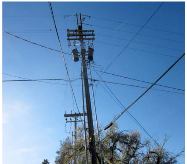
FIG. X1.3 Typical pole-mounted electrical transformers that may contain PCBs.