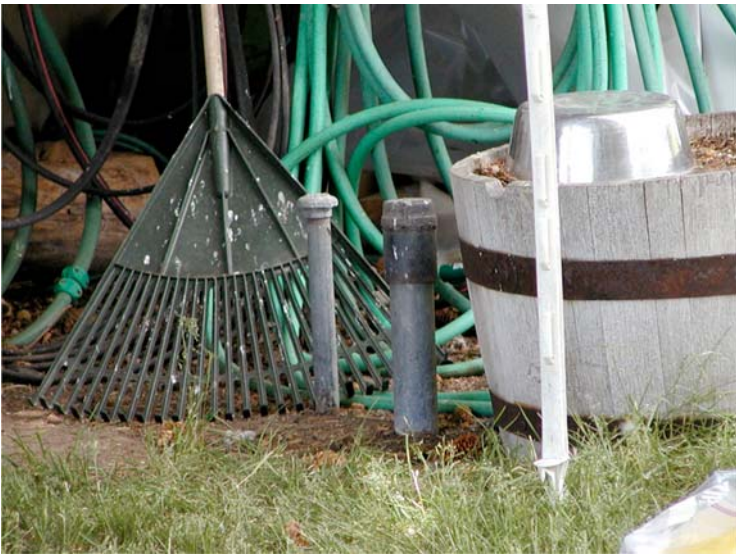
FIG. X1.7 Fill pipe and vent pipe leading to an underground storage tank containing fuel oil in the yard of a single family home.