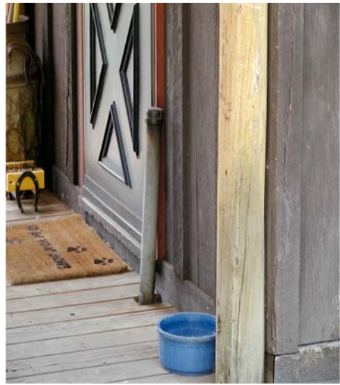
FIG. X1.9 Fill pipe for an underground storage tank containing fuel oil located on the back porch of a single family home. Storage Tank