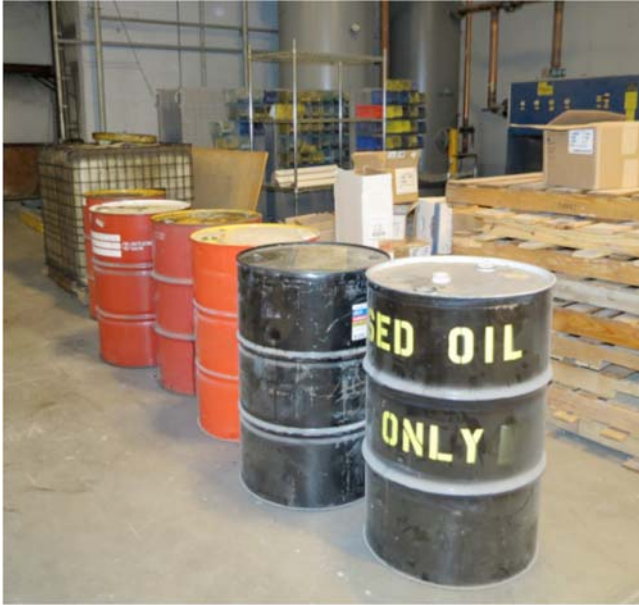
FIG. X1.1 Indoor chemical and used oil storage in 55-gal (208-L) steel drums.