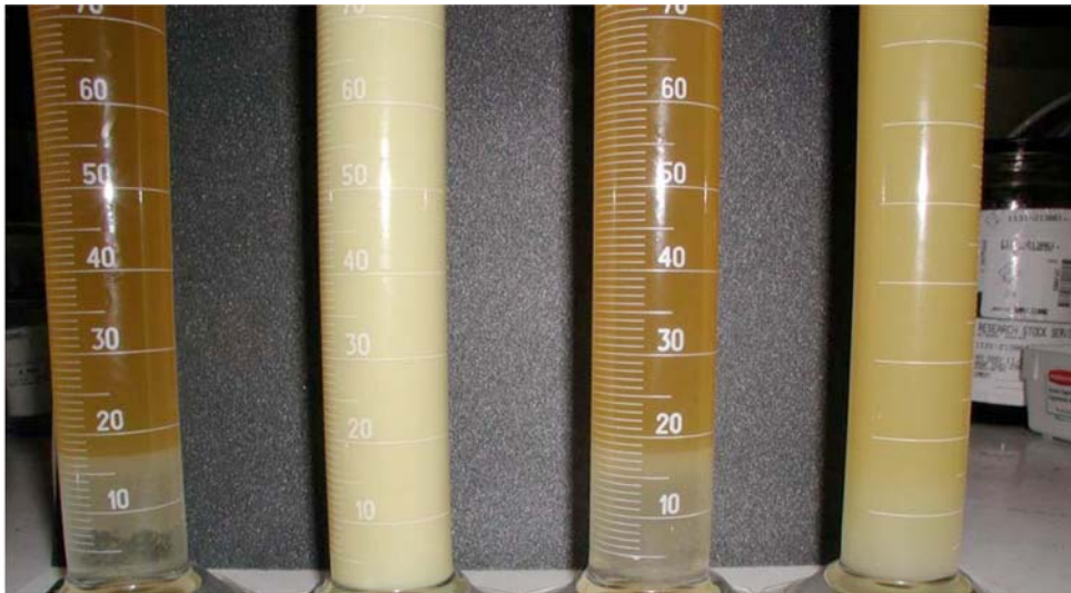
a) Aqueous layer b) Non-aqueous layer c) Aqueous layer d) Non-aqueous layer