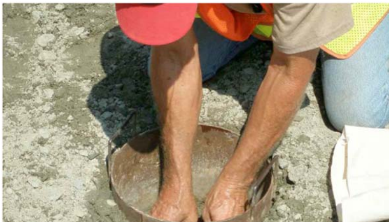
FIG. 5 Proper Use of Metal Template For Sampling Mixed Coarse and Fine Aggregate From Roadway Grade

NOTE 11—Guidance for determining the number of samples required to obtain the desired level of confidence in test results may be found in Test Method D2234/D2234M, Practice E105, Practice E122, and Practice E141.