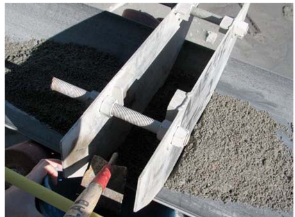
FIG. 1 Belt Sampling Template

5.3.3 Sampling from Stockpiles —Avoid sampling coarse aggregate or mixed coarse and fine aggregate from stockpiles whenever possible, particularly when the sampling is done for the purpose of determining aggregate properties that may be dependent upon the grading of the sample. If circumstances make it necessary to obtain samples from a stockpile of coarse aggregate or a stockpile of combined coarse and fine aggregate, design a sampling plan for the specific case under consideration to ensure that segregation does not introduce a bias in the results. This approach will allow the sampling agency to use a sampling plan that will give a confidence in results obtained therefrom that is agreed upon by all parties concerned to be