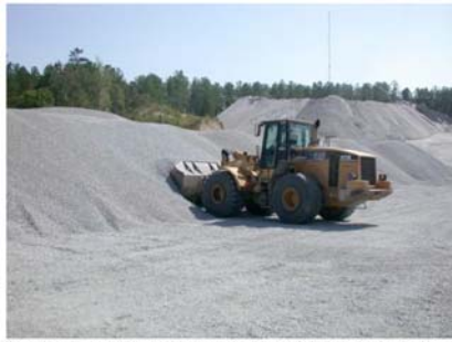
Step 1. Loader enters stockpile with bucket approximately 150mm [6 in.] above ground level