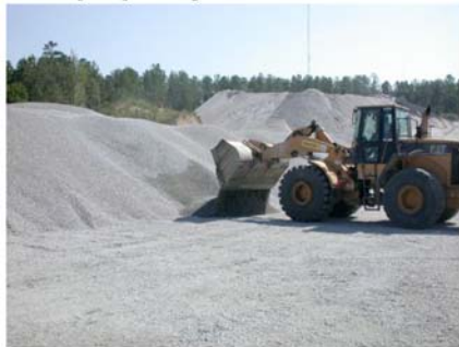
Step 2. Loader gently rolls the material out of the bucket to form a small pile