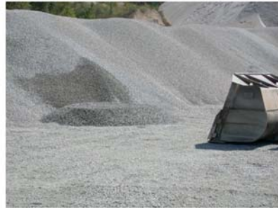
Step 4. Sampling pad