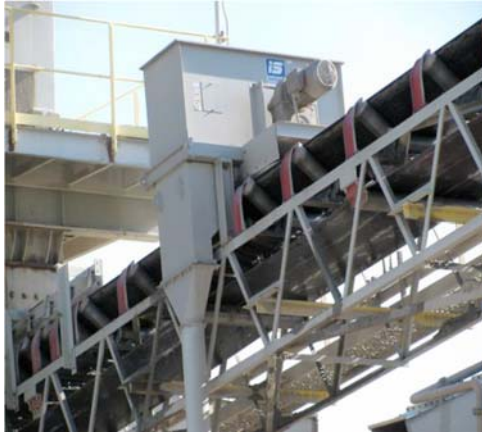
FIG. 2 Automatic Belt Sampler

acceptable for the particular situation. The sampling plan shall define the number of samples necessary to represent lots and sublots of specific sizes. The sampling plan shall also define any specialized site-specific sampling techniques or procedures that are required to ensure unbiased samples for existing conditions. The owner and supplier shall agree upon the use of any specialized site-specific techniques or procedures. When site-specific techniques or procedures are developed for sampling a stockpile, those procedures shall supersede the procedures given in 5.3.3.1. (Note 6). General principles for sampling from stockpiles are applicable to sampling from trucks, rail cars, barges, or other transportation units.