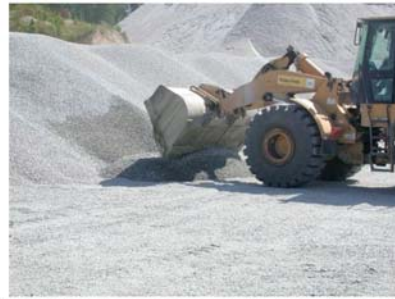
Step 3. Loader reaches across the small pile, lowers bucket, and back-drags small pile to form the sampling pad