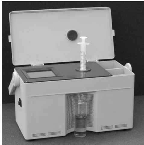
FIG. A1.4 Apparatus Exterior