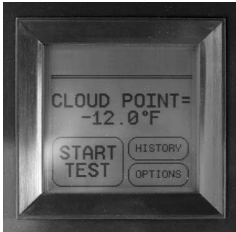
FIG. A1.3 Apparatus Interface