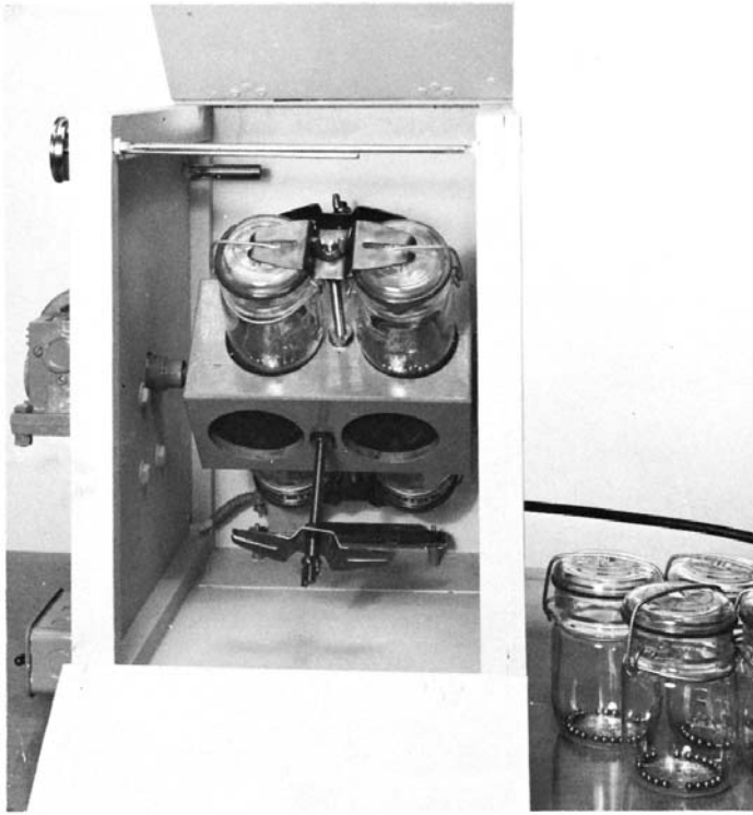
FIG. 1 Washing Machine

4.6 Dies , suitable to cut rubber rings and specimens.