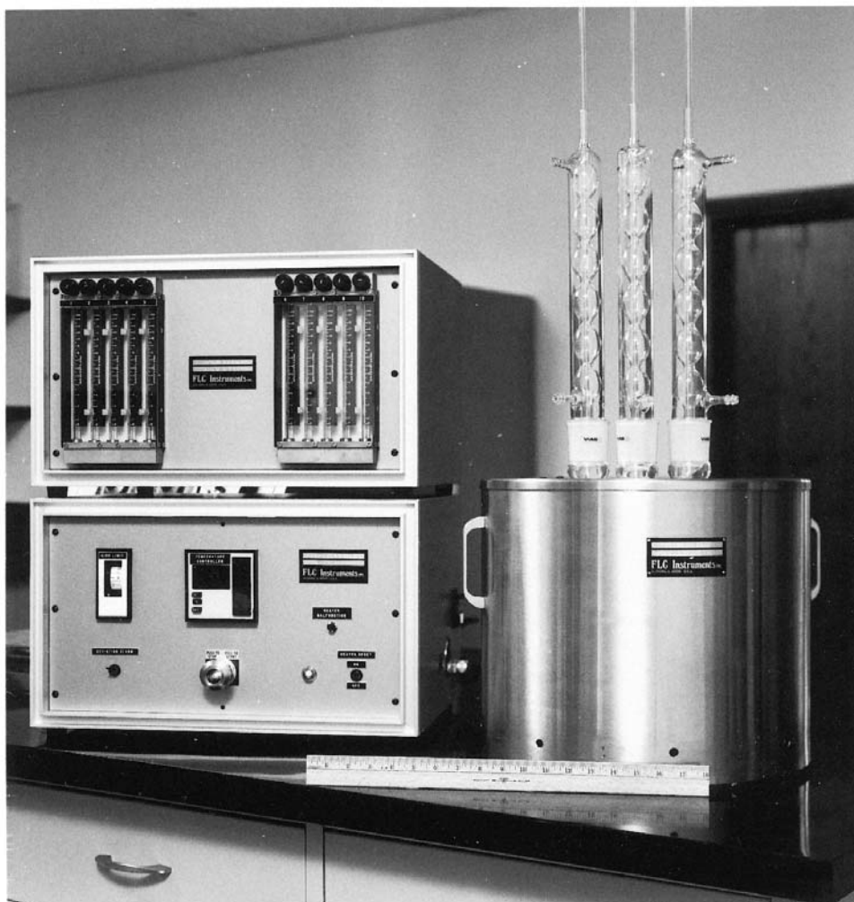
FIG. 1 Apparatus, Showing Gas Flow Control System, Temperature Control System, and Heating Block