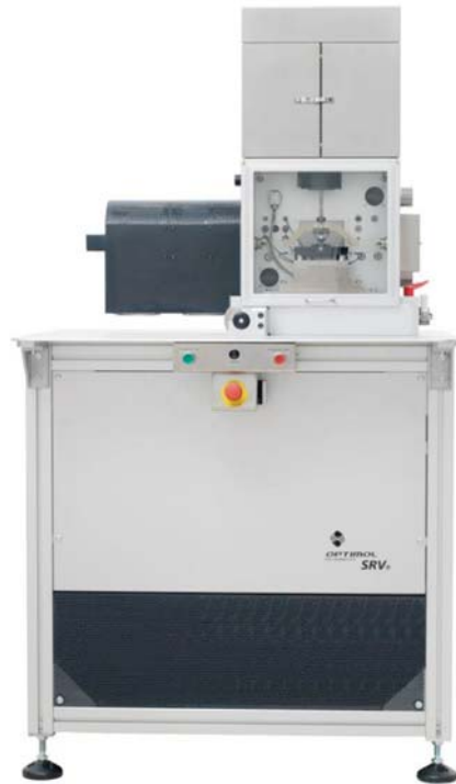
FIG. 3 SRV Test Machine (Model IV)