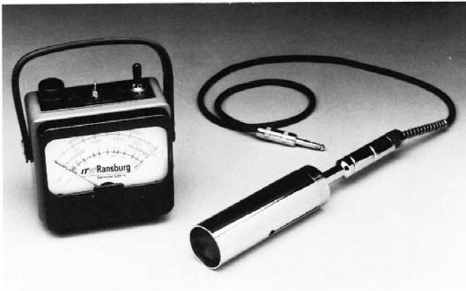
FIG. 1 Analog Paint Application Test Assembly