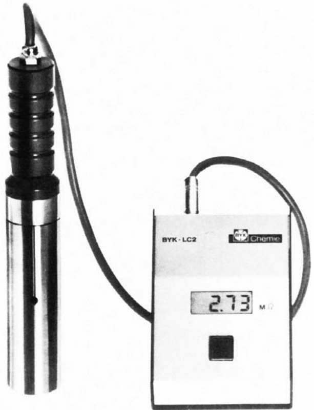
FIG. 3 Conductivity Meter

7.1 Paint Application Test Assembly —designed to provide measurement of the electrical resistance of paint formulations for all electrostatic applications. To provide greater accuracy in measuring low resistance paints, the meter is equipped with dual range selection. Range “A” is .005 to 1 MΩ, Range “B” is .05 to 20 MΩ. The original version of this device was an analog instrument with a pointer and scale as shown in Fig. 1 and many such instruments are in use. It has been replaced by a digital version, a diagram of which is in Fig. 2.