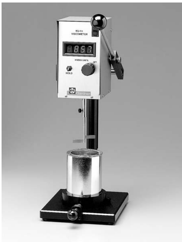
FIG. 5 Digital Stormer-Type Viscometer

15.2 Suitable Hydrocarbon Oils, calibrated in KU and traceable to NIST, available commercially.