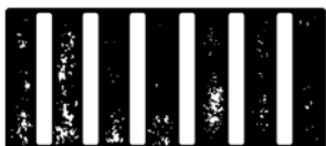
FIG. 3 Stroboscopic Lines Opening When Timer is Adjusted to Exactly 200 r/min

11.1.3 If desired, determine from Table 1 the KU corresponding to the load to produce 100 revolutions in 30 s.