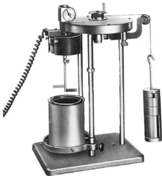
FIG. 1 Stormer Viscometer with Paddle-Type Rotor and Stroboscopic Timer

9.3 When the temperature of the specimen has reached equilibrium, stir it vigorously, being careful to avoid entrapping air, and place the container immediately on the platform