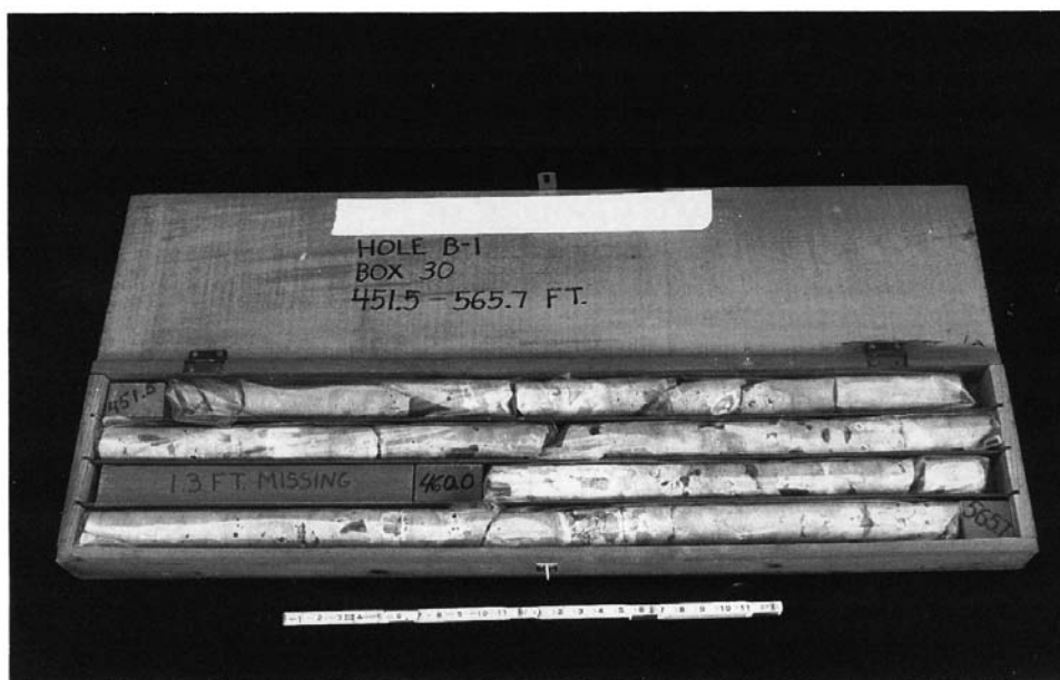
FIG. 2 Typical Wooden Core Box Showing Core Placement, Labeling, and Polyethylene Layflat Tubing Placed Over Core as Suggested for Routine Care (as in 7.5.1)

NOTE 3—It is important that plastic microcrystalline wax be utilized, as