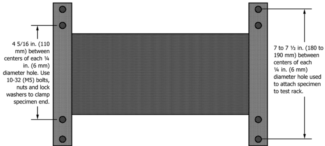
FIG. 2 Diagram Showing Clamping Bars Used for Attaching Type VI Sheeting Specimens to Test Rack for Outdoor Exposure

the panel is struck on the sheeting side and the panel is supported by a steel fixture having a cylindrical hole as described in Test Method D2794, Section 6.3).