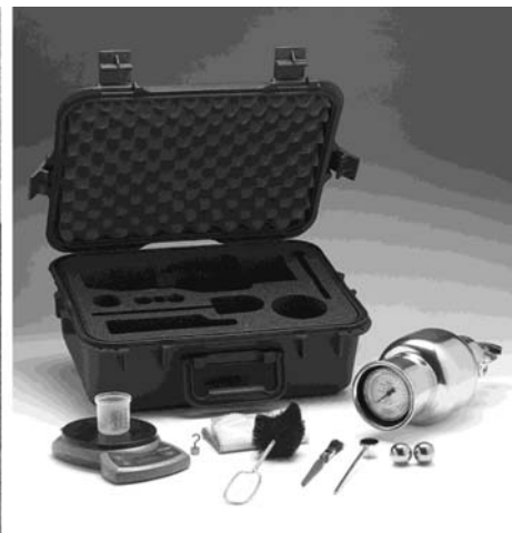
FIG. 1 Typical Calcium Carbide Gas Pressure Test Apparatus for Water Content of Soil Set with Manual Tared Balance