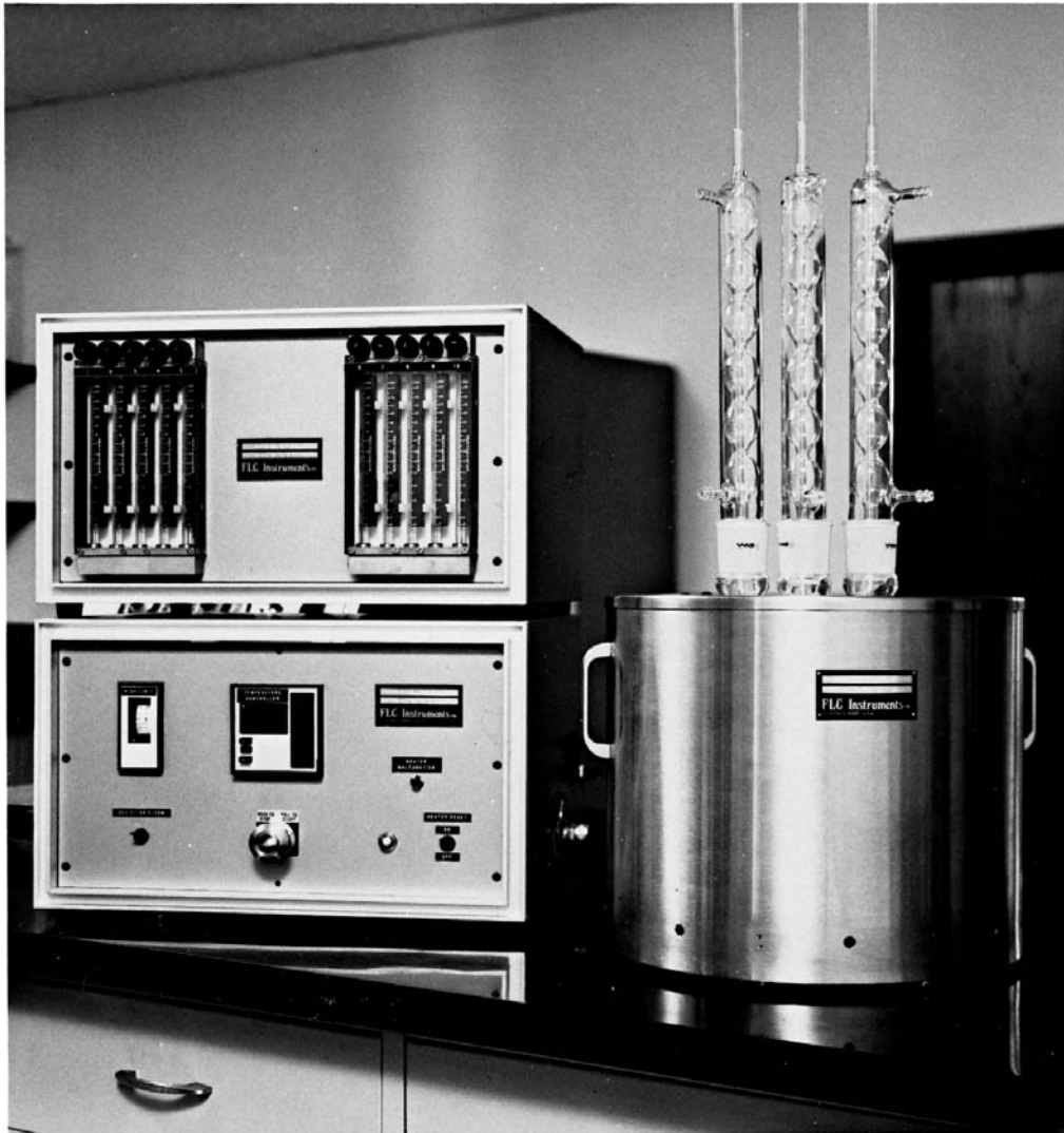
FIG. 1 Universal Oxidation Test Apparatus