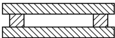
FIG. 1 Flash Picture-Frame Mold

5.2.1 Mold Types —Several different types of mold geometries can be used for the compression molding of test specimens of thermoplastics. In general, however, the molds used will fall into one of two categories: a flash-type mold (see Figs. 1 and 2) or a positive-type mold (see Fig. 3). The