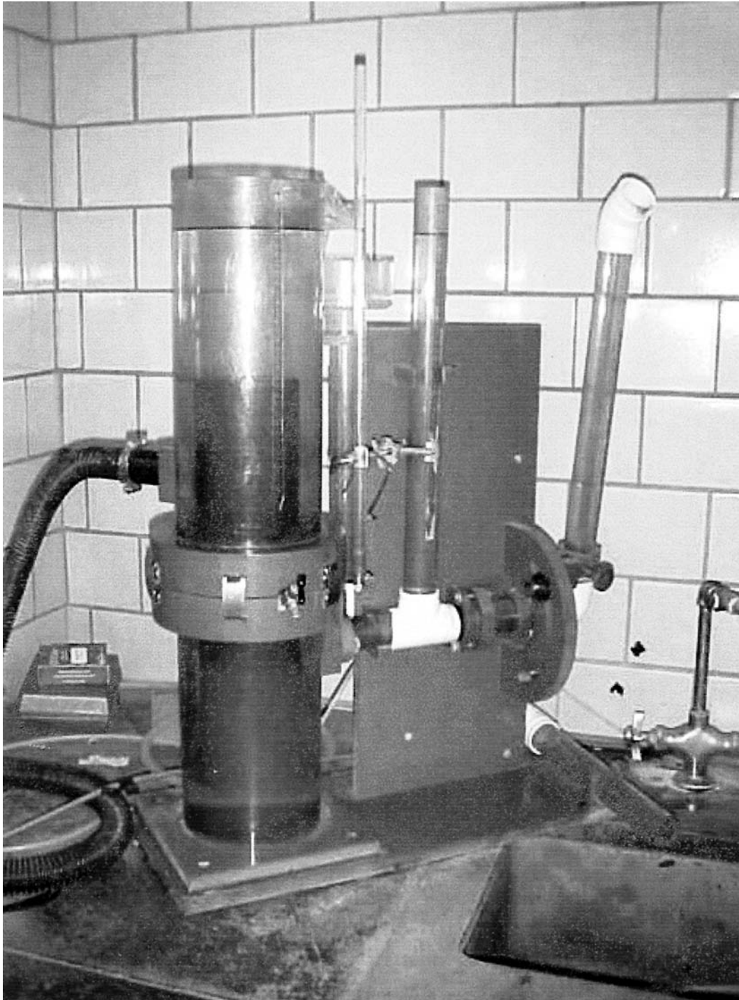
FIG. 1 Constant and Falling Head Permeability Apparatus

6.4.2.2 The tail (downstream) pressure sensor must be installed 25 mm or more from the geotextile test specimen, and within the 25-mm diameter section.