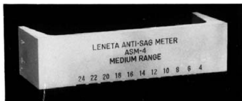
FIG. 2 Medium Range Anti-Sag Meter

drying in this position, the drawdown is examined and rated for sagging. A typical sag pattern obtained by this procedure is shown in Fig. 3.