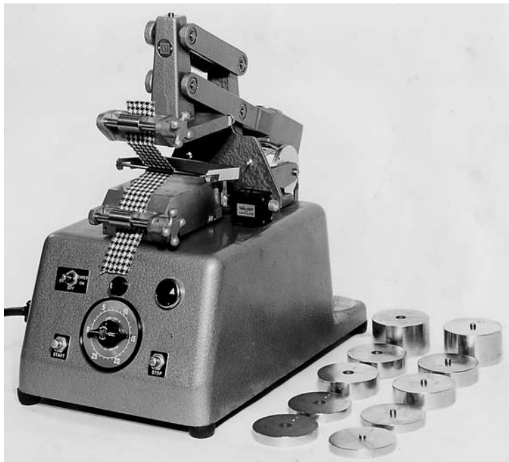
FIG. 2 Commercial Flexing and Abrasion Tester

6.1.1.2 The flex block is capable of reciprocating at 115 \pm 10 double strokes per minute of 25 \pm 2 -mm ( 1 \pm 0.1 -in.) stroke length.