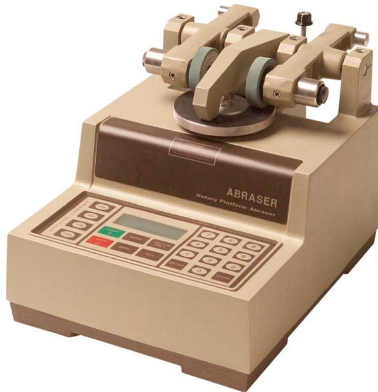
FIG. 1 Rotary Platform Double Head Abrader

6.1.3 Motor capable of rotating the platform and specimen at a speed of 72 \pm 2 r/min.