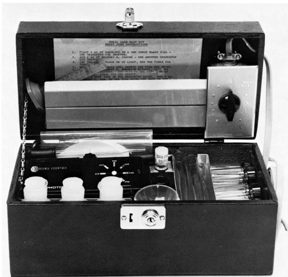
FIG. 1 Mobil Lead Test Kit

interfere to give high results: Fe II, Fe III, Co II, Ni II, Cu II, Zn II, Cd II, Mn II, Sn II, V IV, Pb II, U VI, Ti IV, and the rare earths.