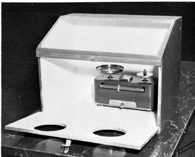
FIG. 1 Weighing Box and Balance

6.4 Place the pad assembly with the tape facing down on the roadway so the taped edge is facing the distributor. Apply pressure to the taped pad to secure it to the roadway. Continue this operation for the remaining pads for the entire width desired for measurement.