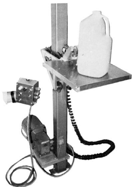
FIG. 1 Apparatus for Dropping Containers

5.4 Before proceeding with this test method, reference the specification of the material being tested. Any test specimen preparation, conditioning, dimensions, or testing parameters, or combination thereof, covered in the materials specification shall take precedence over those mentioned in this test method. If there are no material specifications, then the default conditions apply.