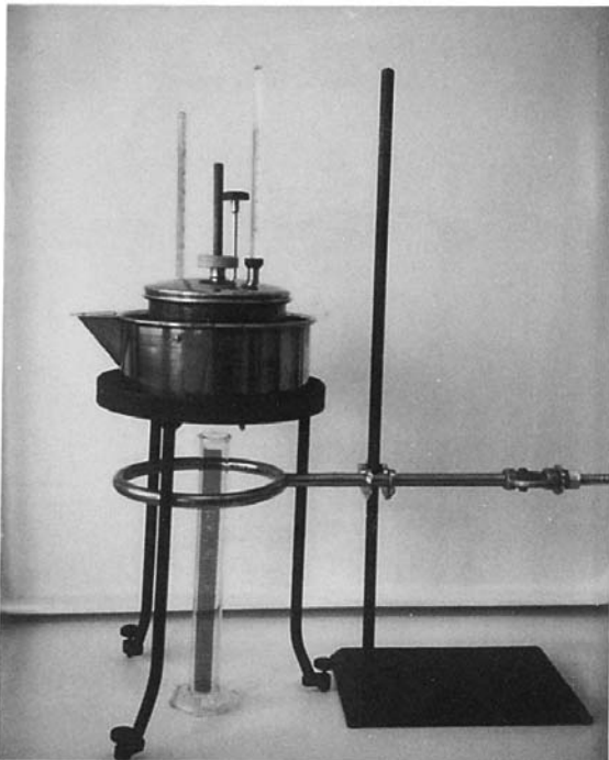
FIG. 2 Engler Viscosity Apparatus Using the 50 mL Graduate